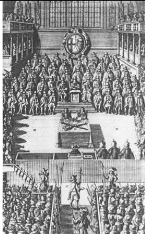
From Norton Topics Online: http://www.norton.com/nael/17century/topic%5F3trial.htm

From King Charls his Tryal at the High Court of Justice (London, 1650); John Nalson, A True Copy of the Journal of the High Court of Justice for the Tryal of K. Charles (London, 1684); and John Rushworth, Historical Collections , 8 vols. (London 1721–22), Vol. 7. Printed in The Trial of Charles I: A Documentary History , David Lagomarsino and Charles T. Wood, editors, © 1989 by the Trustees of Dartmouth College, by permission [to Norton] of University Press of New England.