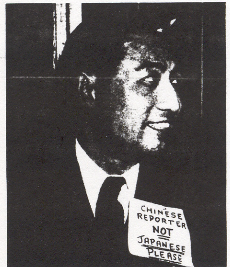
Chinese journalist, Joe Chiang, found it necessary to advertise his nationality to gain admittance to White House press conference. Under Immigration Act of 1924, Japs and Chinese, as members of the "yellow race," are barred from immigration and naturalization.

The typical Northern Chinese, represented by Ong Wen-hao, Chungking's Minister of Economic Affairs (left, above), is relatively tall and slenderly built. His complexion is parchment yellow, his face long and delicately boned, his nose more finely bridged. Representative of the Japanese people as a whole is Premier and General Hideki Tojo (left, below), who betrays aboriginal antecedents in a squat, long-torsoed build, a broader, more massively boned head and face, flat, often pug, nose, yellow-ocher skin and heavier beard. From this average type, aristocratic Japs, who claim kinship to the Imperial Household, diverge sharply. They are proud to approximate the patrician lines of the Northern Chinese.